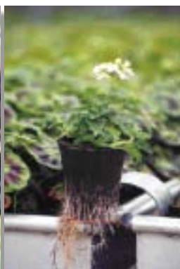
▲ Pélarгонium (Etampes)