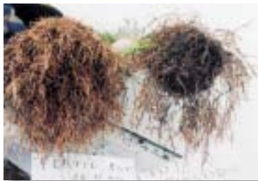
Comparison root development ▶

2 – When a plant grown in a FERTILPOT is planted or repotted (without removing the pot), the dormant root buds set during aerial containment are immediately activated. There is no shock from transplanting, this difference is particularly marked when ground conditions are difficult (cold, drought, adverse season, etc.). Finally, as there is no deformation in the root system, the plant establishes easily and settles into the soil quickly.