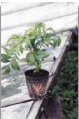
▲ Rose d'Inde (Dreux)