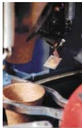
Automatic destacking with FERTILPOT ◀

The speed at which it degrades depends on different parameters, primarily linked with the intensity of microbial activity. With spring planting in a temperate climate, only a few fragments of the wall will still be visible after a few months.