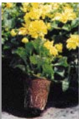
▲ Dahlia (Vitry-sur-Seine)